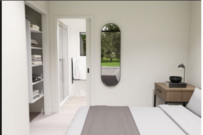
MASTER BEDROOM WITH ENSUITE